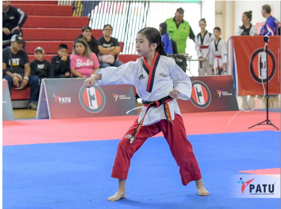
NOVEMBER, PANAMERICAN YOUTH CHAMPIONSHIP PERU